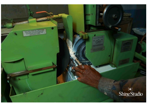
Centerless Grinding Machine