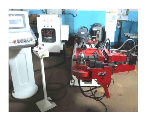
3X CNC Tube Bending Machine