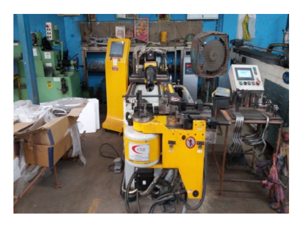
Single Axis Bending Machine